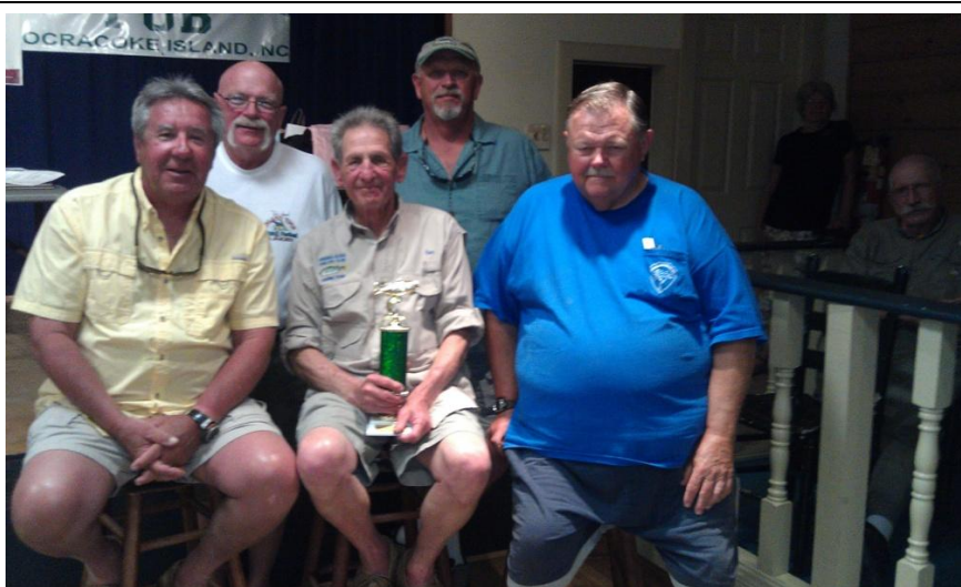
Ocracoke Fishing Team