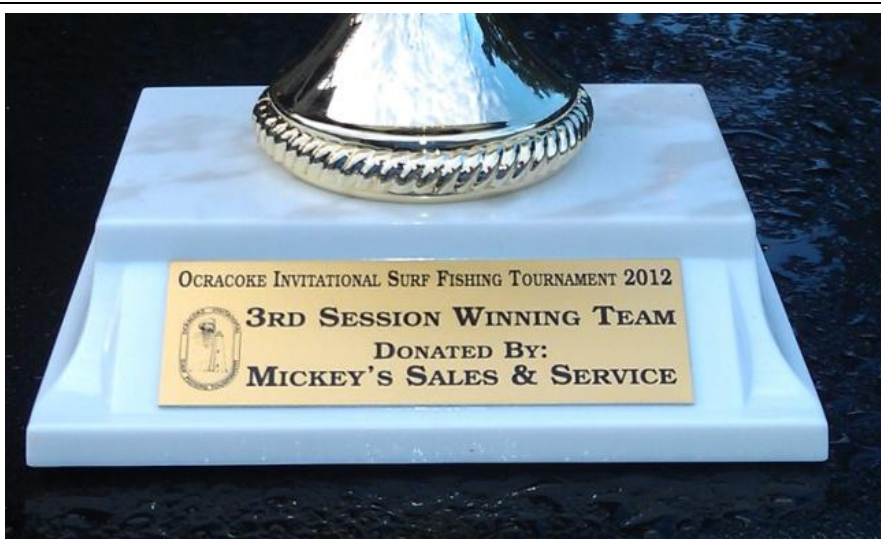
Ocracoke Fishing Trophy